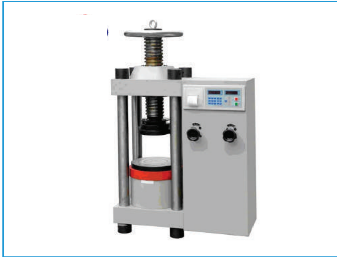
COMPRESSION TESTING MACHINE