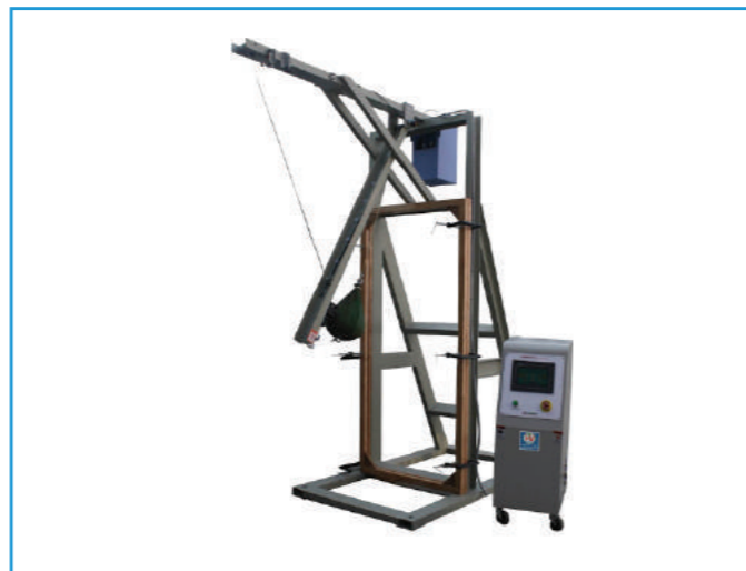
HUMAN IMPACT TEST APPARATUS

To determine the tensile strength of concrete to determine the load at which the concrete members may crack.