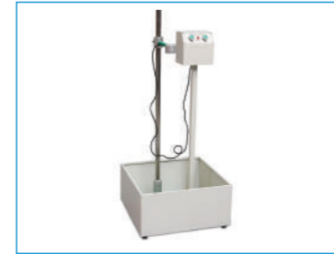
BALL DROP TEST APPARATUS

To determine impact resistance of Glasses.