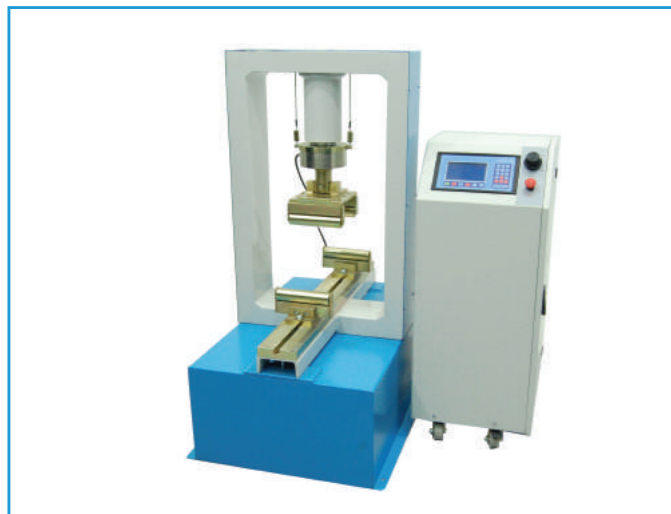
TENSILE SPLITTING & FLEXURAL MACHINE

It is used for the determination of resistance to wear for Cement and concrete flooring tiles.