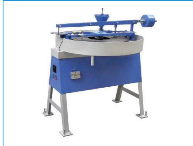
TILE ABRASION TESTING MACHINE

It is used to determine the compression force or crush resistance of a material and the ability of the material to re occur after a specified compressive force is applied.