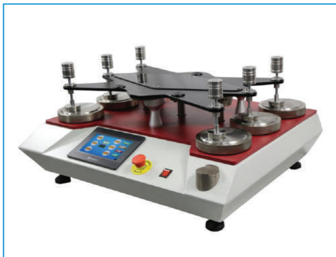
MARTINDALE ABRASION TESTER

It allows to determine the resistance of rubber products to the growth of a cut during repeated flexing.