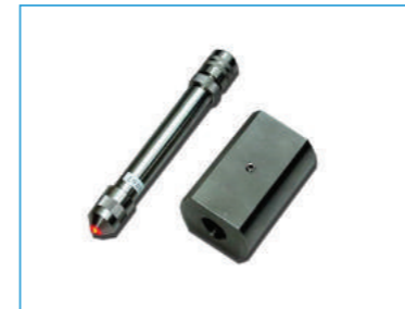
SHARP POINT TESTER

It can determine whether accessible edges on toys or other products are likely to cause injury.