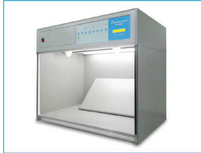
COLOUR MATCHING CABINET

It is used for delivering the heat treatment to the product. The temperature range covered by ovens is between 50°C - 250°C.