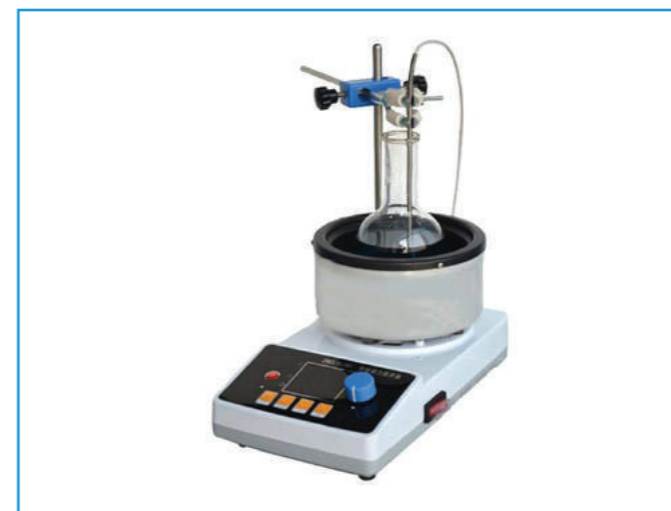
DIGITAL OIL BATH

It is used for colour matching and assessment of those products where there is a need to maintain colour consistency and quality.