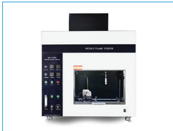
NEEDLE FLAME TEST APPARATUS

It measures the resistance and is used to verify that electrical connections are proper.