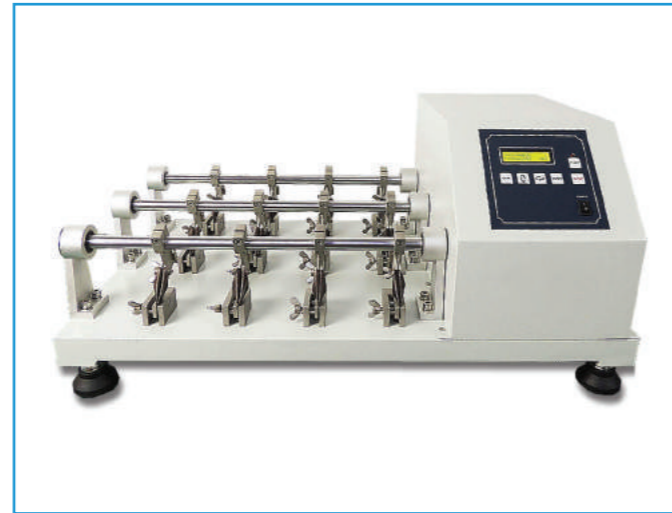
BENNEWART FLEX TESTER

It is a rotary drum abrasion tester to test abrasion resistance of rubber products on specified grade abrasive paper under certain pressure.