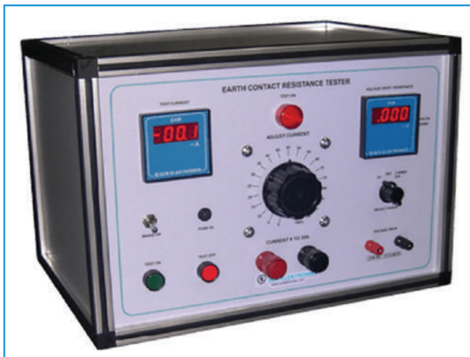
EARTHING CONTACT RESISTANCE TESTER

This type of furnaces are used for the applications where there is huge demand of testing the sample at high temperature and to determine.