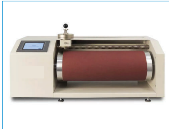
DIN ABRASION TESTER