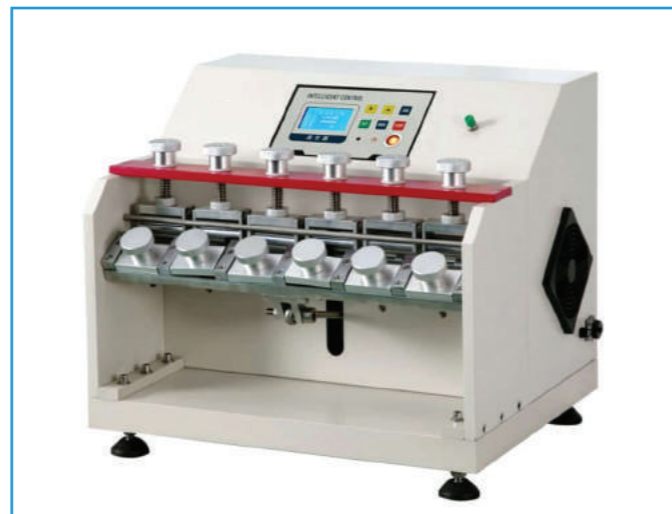
ROSS FLEX TESTER

This equipment is ideal for determining the abrasion resistance of upper, lining, socking and similar types of Shoe materials.