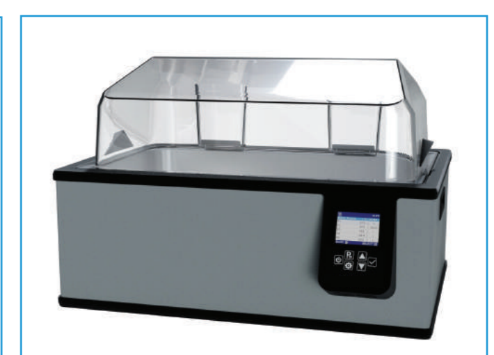
DIGITAL WATER BATH

This produces circular shaking of the sieves. It is used for separation and size determination of particles.