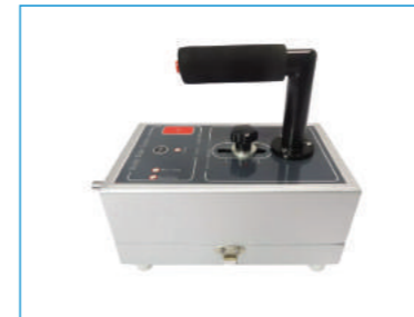
SHARP EDGE TESTER

Determination of whether the safety glazing material has a certain minimum strength and cohesion under impact from a small hard object.